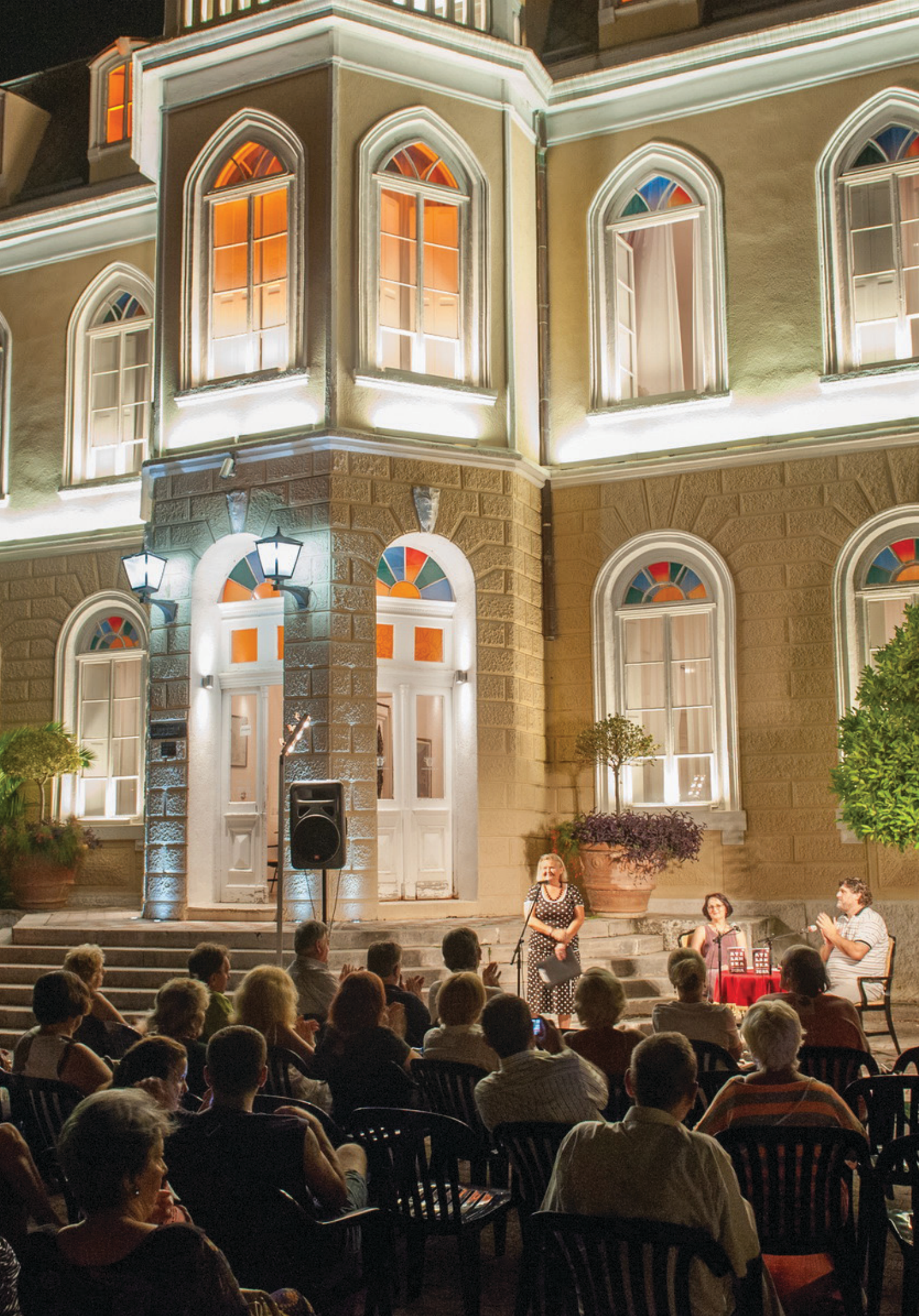
King Nikola Palace in Bar