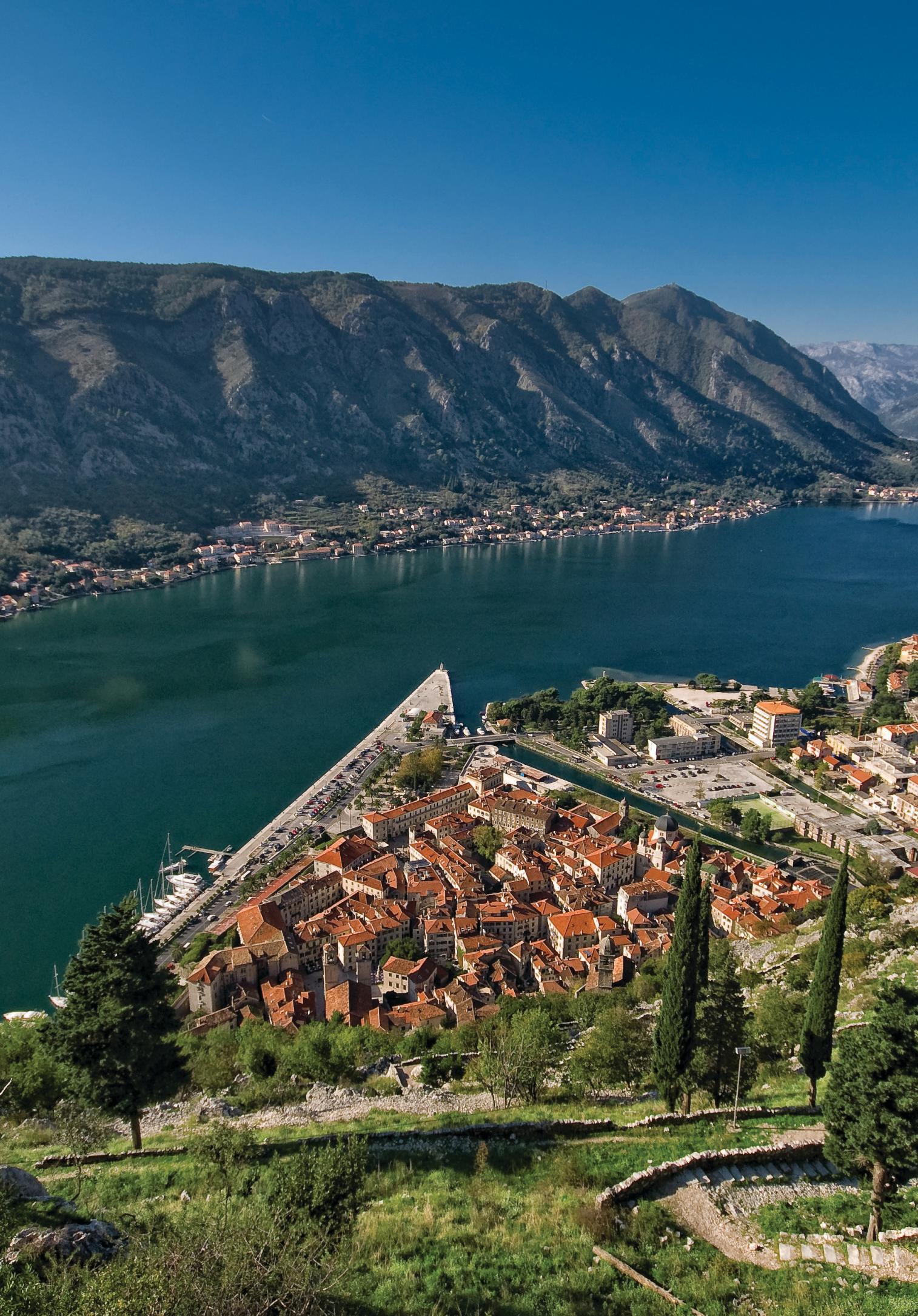
Old Town Kotor