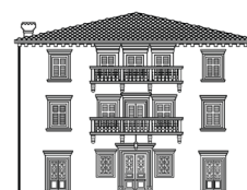
POMORSKI MUZEJ CRNE GORE KOTOR