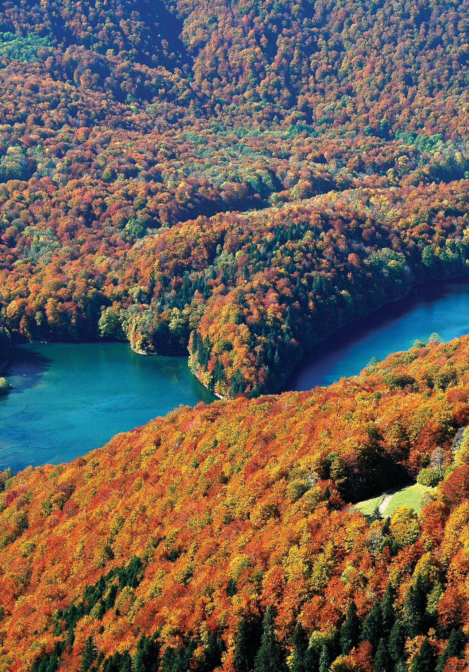
National Park Biogradska Gora