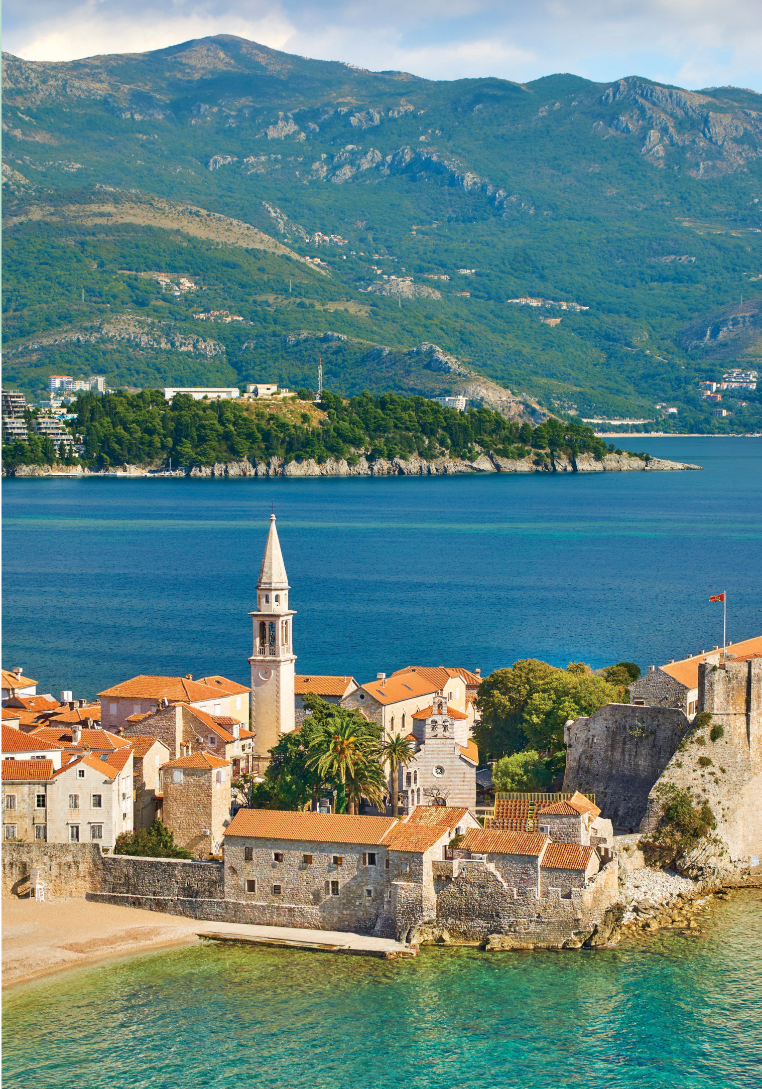
Budva Old Town