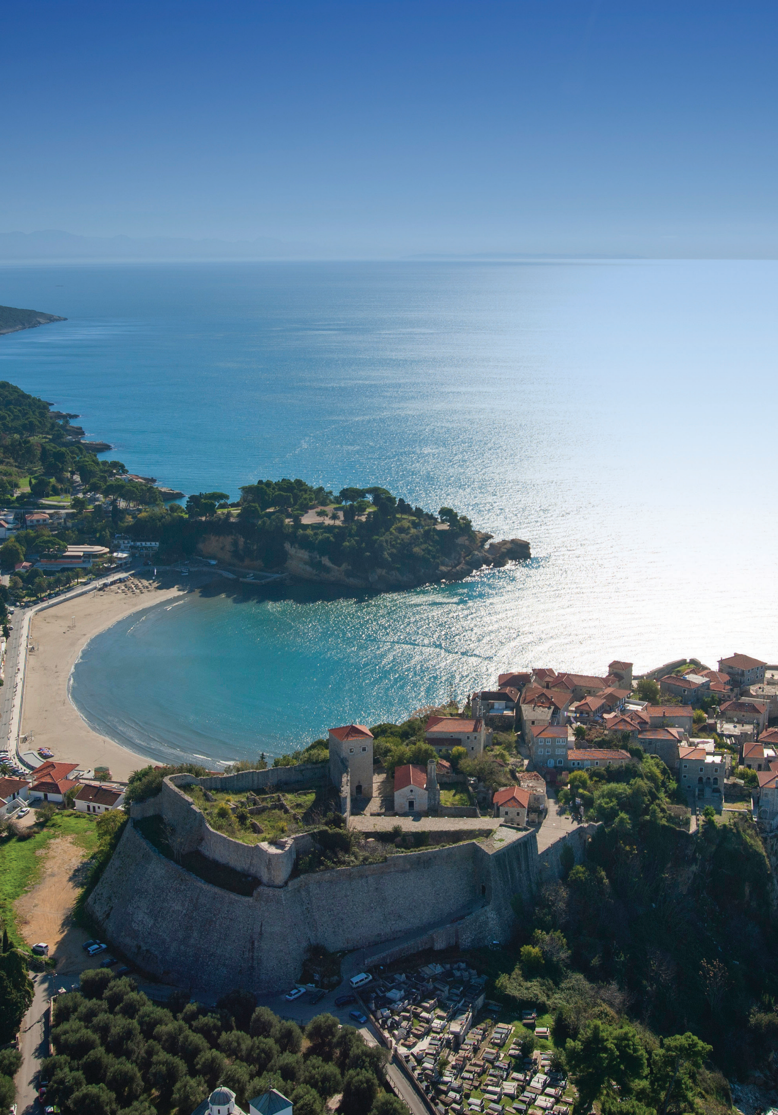
Ulcinj, Old Town